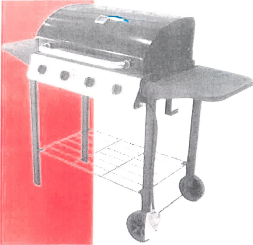
Item Number 3170976 (HSUM006SB) – 4 burner hooded bbq with steel cabinet & side burner – $198.00 current range