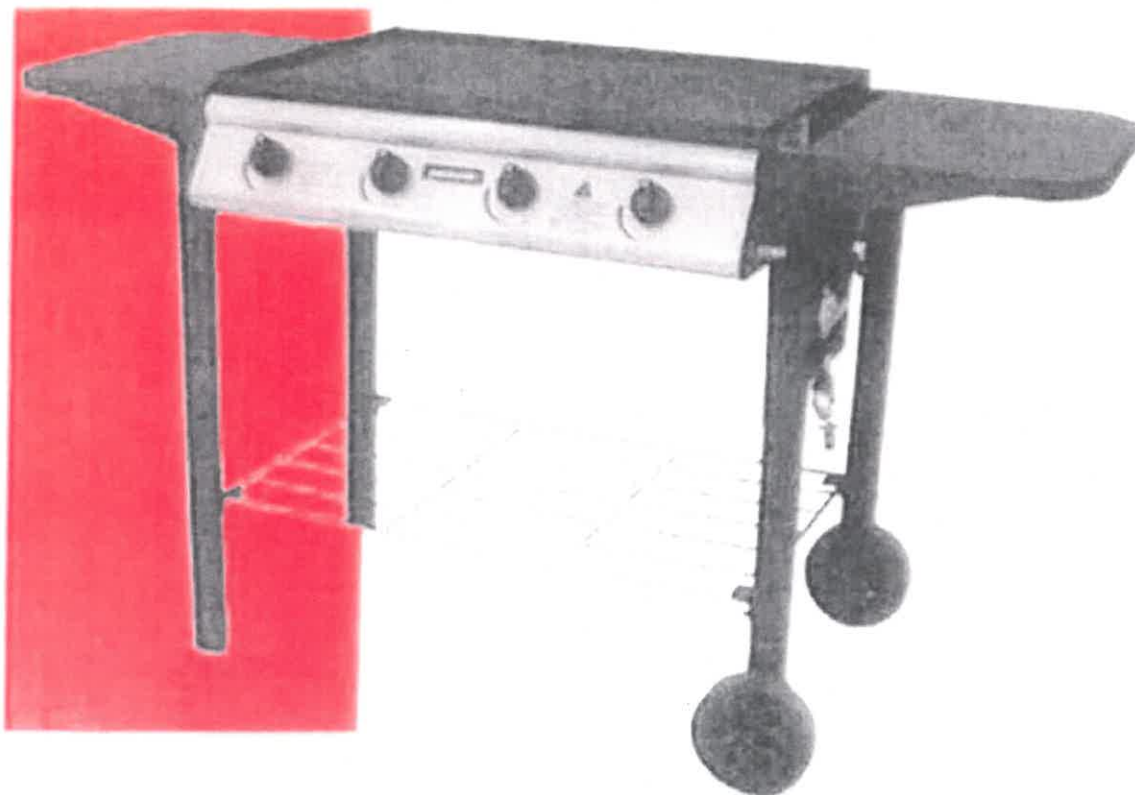
So the last incident refers to Item Number 3170544 (above) – 4 burner flat top hot plate bbq with steel trolley – which is a deleted product (AGA certificate attached).